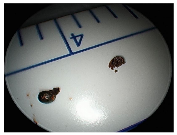
Figure 5: Metal piece removed from the middle ear