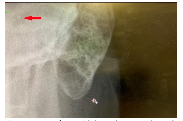
Figure 2: X-ray of mastoid showed suspected metal FB