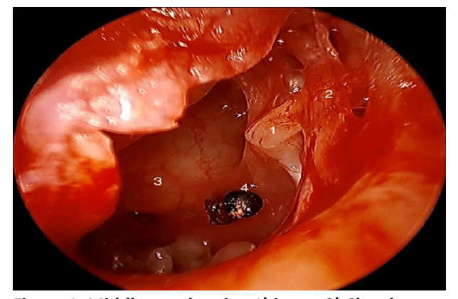
Figure 4: Middle ear showing 1) incus, 2) Chorda tympani nerve, 3) Promontory, 4) Metallic FB