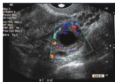
Figure 1: Color Doppler image of the ovarian blood flow in the luteal phase of the cycle