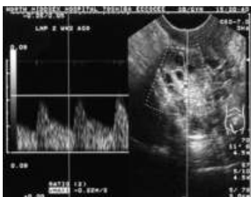
Figure 3: A typical flow velocity diagram at the stroma shows higher uterine artery velocity in a 35-year-old polycystic ovary syndrome patient