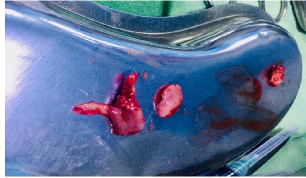
Figure 2: Graft taken from the inferior turbinate