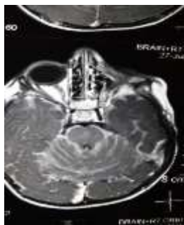
Figure 3. T1W MRI brain with contrast, axial section Through orbits demonstrate meningeal metastasis