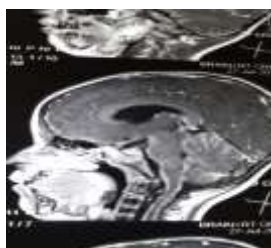
Figure 5: T1W MRI brain sagittal section demonstrates diffuse meningeal metastasis