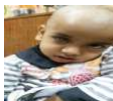
Figure 1:Extraocular Presentation