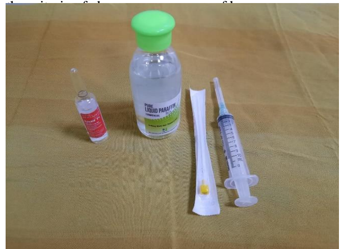
Figure 1: Liquid paraffin, 10 cc syringe, spinal needle

Before applying local anaesthesia, the patient was asked to gargle with 4% Lidocaine to minimize cough reflex. Local anaesthesia was given at the cricothyroid membrane by visualizing the vocal cords under a flexible nasopharyngoscope. 1cc to 3cc liquid paraffin was loaded in a 10 cc syringe (Figure 1) and during injecting liquid paraffin, the vocal cords were visualized by nasopharyngoscope and the patient was advised to produce sounds to see the results of the injection (Figure 2). After the procedure, the patient was kept under observation for 2 hours. The first follow-up was done after 1 month and 2 nd follow-up was done after 2 months and later one was telephonically for 2 years. The hoarseness of voice was assessed and evaluated as per