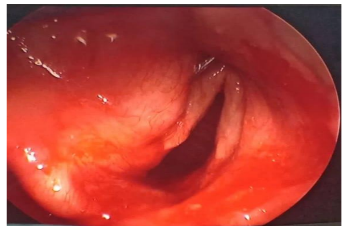
Figure 2: Medialized vocal cord