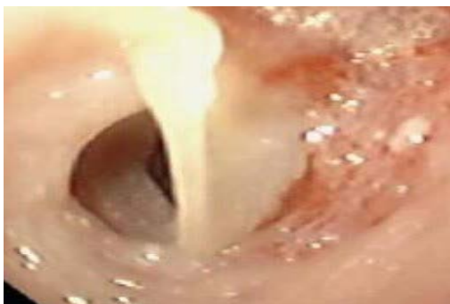
Fig 3: Endoscopic view of esophageal web