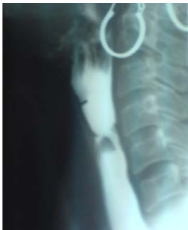
Fig 2: Esophageal web on barium swallow

Of the total 25 biopsies, normal esophageal mucosa was diagnosed in 23 while squamous cell carcinoma was found in two patients giving incidence of carcinoma as 8%. After esophageal dilatation 20 (87%) patients had no difficulty in swallowing six months after dilatation (Table 2). In 2 patients there was mild dysphagia after 3 months of follow up. Second dilatation was done in these two patients. These patients then became symptom free and no web was seen on subsequent barium swallow x-ray.